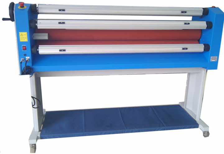
Integrated rear rewind for roll-to-roll applications